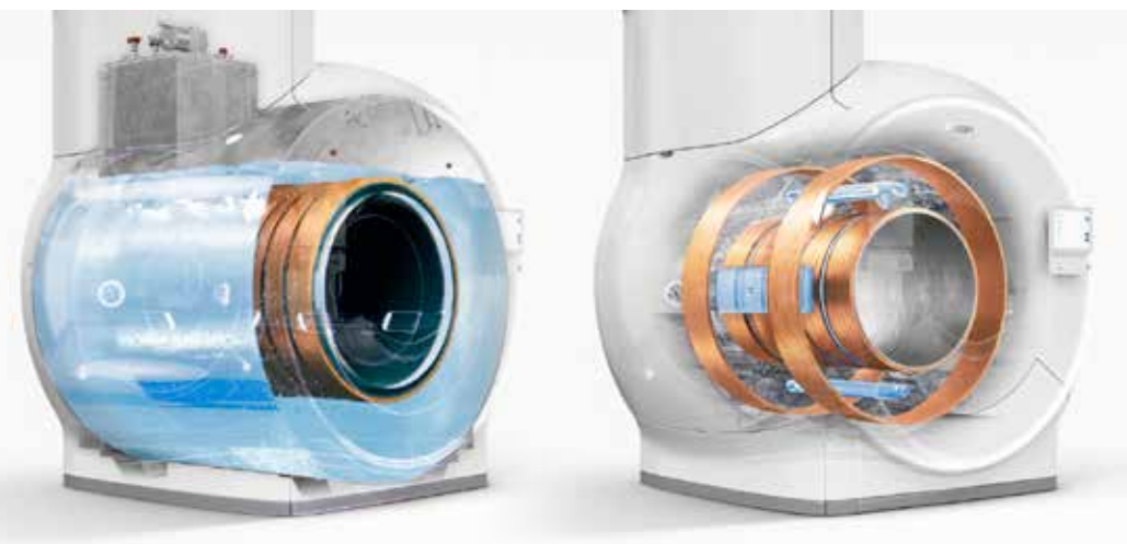
Classic magnet technology ~1,500 liters of liquid helium

In case of spontaneous loss of field, the temperature of the superconducting coils increases and the pressure in the cooling system increases to a medium pressure that is fully contained. This pressure is four times lower than the pressure that was used when filled during manufacturing (at room temperature). The magnet is fully designed to accommodate this and meets the ASME and PED standards related to pressurized vessels.